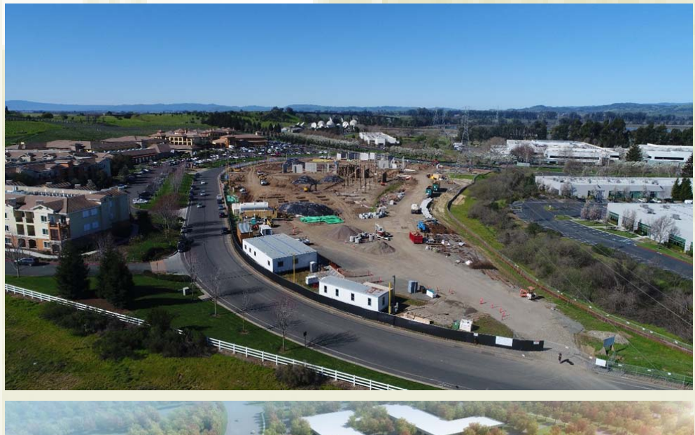
An aerial view of the construction site for Meritage Commons

Located across the street from The Meritage Resort and Spa, the hotel enhancement will feature 145 guest rooms inclusive of 39 suites, an outdoor pool area, and a food and wine village. The Meritage Commons will complement the existing Meritage Resort by introducing new amenities that guests and residents can enjoy, including nine tasting rooms, an expansive event lawn for social gatherings and concerts, a demonstration kitchen, and boutique wine-inspired market. Trinitas Cellars and Foley Family Wines are among the wineries set to have a tasting room on site. Construction is expected to be completed in 2018. For more information, renderings, and a virtual tour, go to: www.WeAreNapa.com.