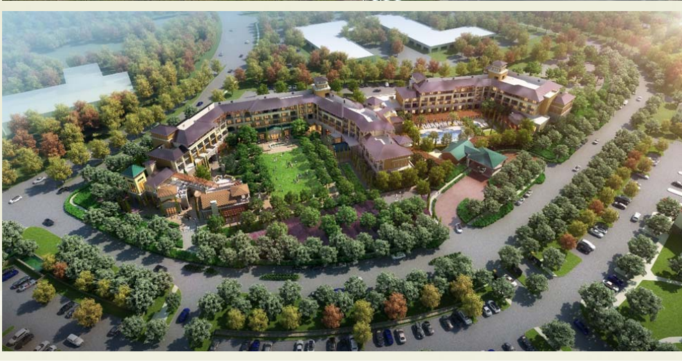
An artistic rendering of Meritage Commons at completion