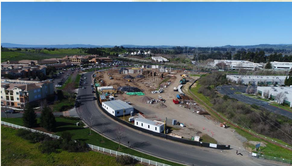
An aerial view of the construction site for Meritage Commons

Located across the street from The Meritage Resort and Spa, the hotel enhancement will feature 145 guest rooms inclusive of 39 suites, an outdoor pool area, and a food and wine village. The Meritage Commons will complement the existing Meritage Resort by introducing new amenities that guests and residents can enjoy, including nine tasting rooms, an expansive event lawn for social gatherings and concerts, a demonstration kitchen, and boutique wine-inspired market. Trinitas Cellars and Foley Family Wines are among the wineries set to have a tasting room on site. Construction is expected to be completed in 2018. For more information, renderings, and a virtual tour, go to: www.WeAreNapa.com .