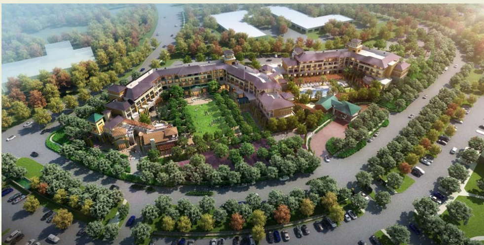
An artistic rendering of Meritage Commons at completion